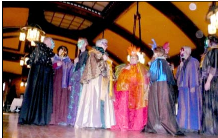
Some of the exotic masks and adjustable capes for the Royal Alexandra Masquerade. See examples online at www.trainsdeluxe.com